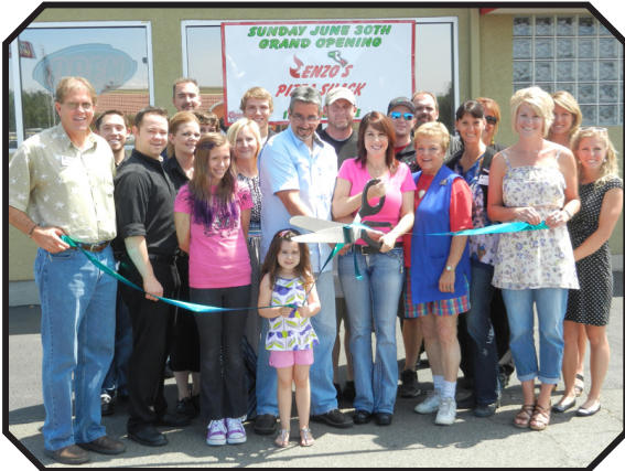
Enzo's Pizza Shack , 3235 I-70 Business Loop Clifton, CO 81520 | (970) 434-1100 (Restaurant) New Business - Family owned pizzeria with New York style pizza, authentic Italian food with a great sports bar atmosphere.