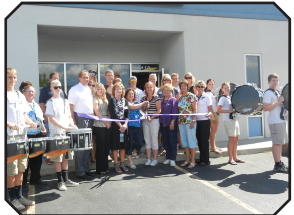
Grand Valley Reprographics and Survey Supply 565 25 Rd Ste 110, Grand Junction, CO 81505 (970) 639-9597 (Printers, Publishers, & Graphic Design) New Business