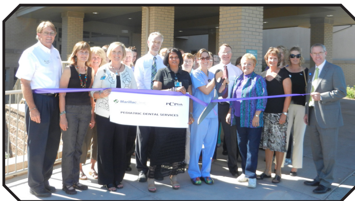
Marillac Clinic Pediatric Dental Services 3150 N 12th St, Grand Junction, CO 81501 (970) 298-6320 (Dental) New Location