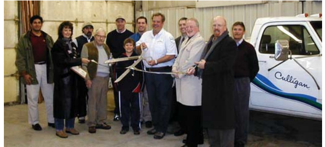
Culligan Water Technologies, 2375 Leland Ave, Grand Junction, CO 81505, (970) 243-0628 - New Location