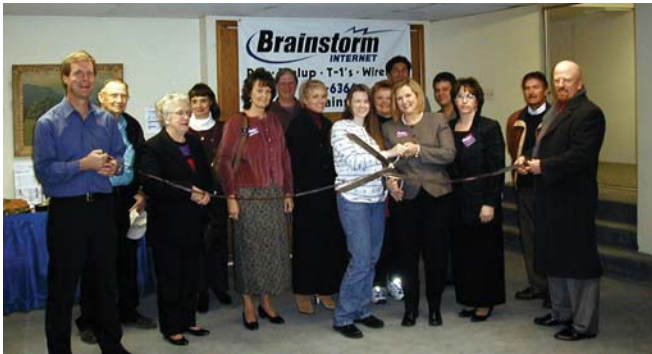
Brainstorm Internet, 634 Main St, Ste 3, Grand Junction, CO 81501, (970) 245-6366 - New Business