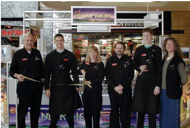
Island Ink-Jet at Mesa Mall, 2424 US Hwy 6 & 50, Grand Junction, CO 81505, (970) 243-4655 - New Business