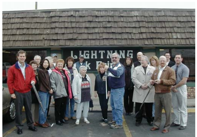
Lightning Quick Print, 1150 N 25th St, Ste F, Grand Junction, CO 81501, (970) 245-1994 - New Owner