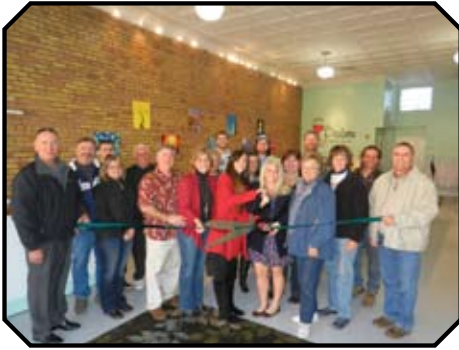
The Palette 205 Colorado Ave Grand Jct., CO 81501 (970) 216-7700 Art Studio New Business