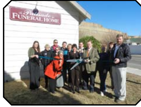
Palisade Funeral Home 729 37 3/10 Rd Palisade, CO 81526 (970) 464-5333 Funeral Home New Business