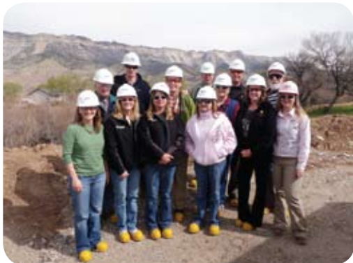
May 2011 Rig Tour Participants

And, we get involved in the political arena around policy development and regulation, primarily at the state and federal level. It is often this activity which