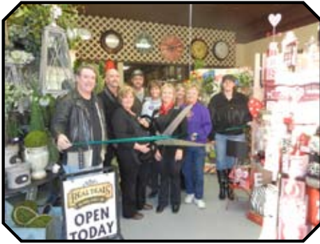
Real Deals on Home Decor 518 Colorado Ave Grand Jct., CO 81501 (970) 314-0787 Retail New Location